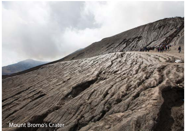
Mount Bromo's Crater