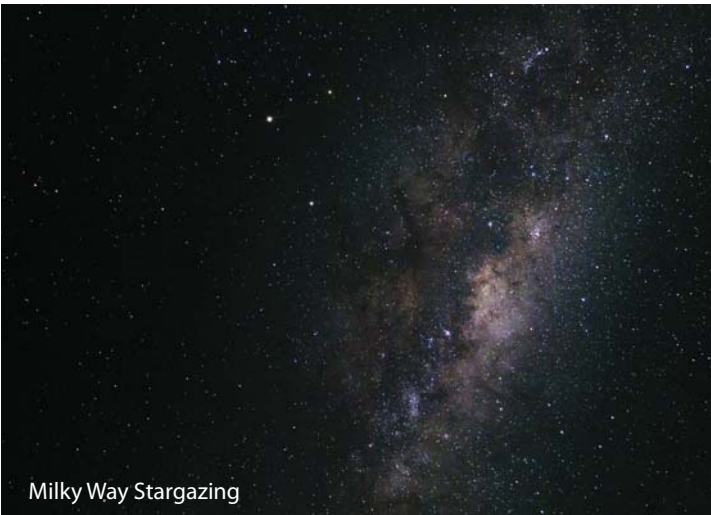
Milky Way Stargazing