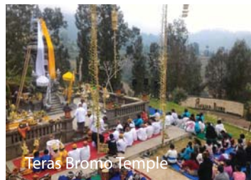
Teras Bromo Temple