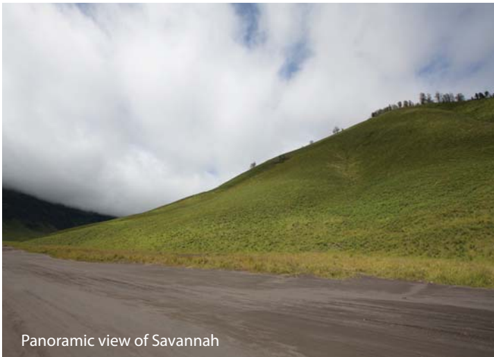
Panoramic view of Savannah