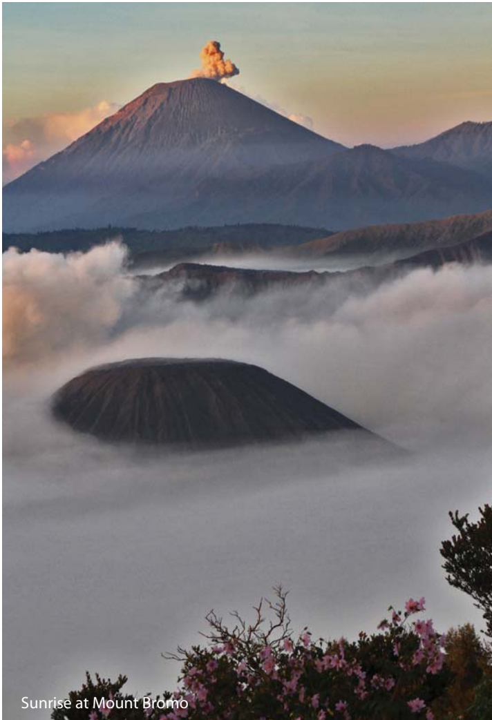
Sunrise at Mount Bromo