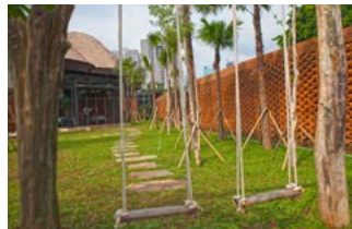
TERAS INDONESIA RAYA

Venue Capacity Indonesia Raya 40 pax seating